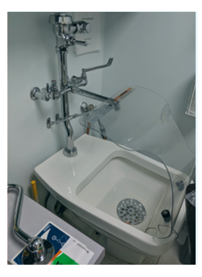
Examples of covers used to mitigate risk of hoppers.